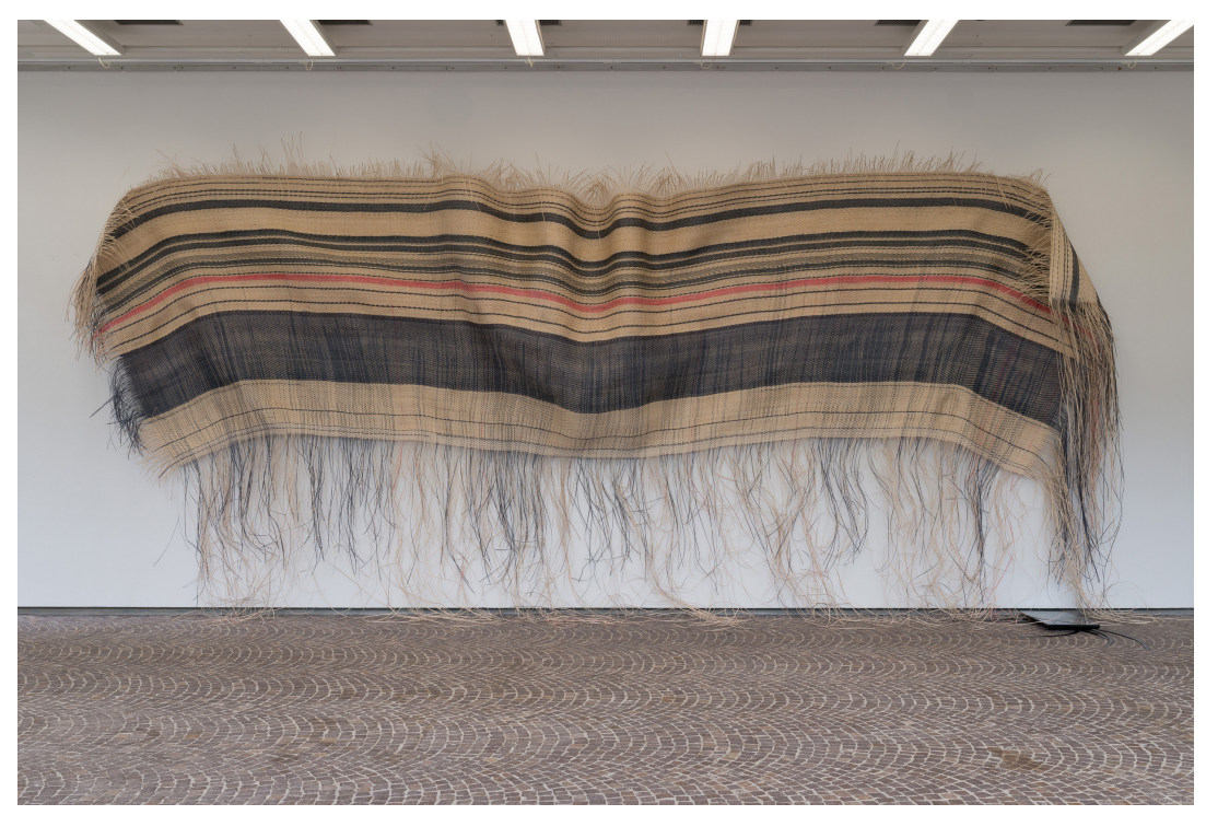
Kasia Fudakowski, Working Title: The Worry Wall, 2017 rattan, stain, steel, video; 500 x 1500 x 10 cm, photo: Sprengel Museum Hannover, Courtesy the artist and ChertLüdde, Berlin

basis e.V. Gutleutstrasse 8–12 60 329 Frankfurt