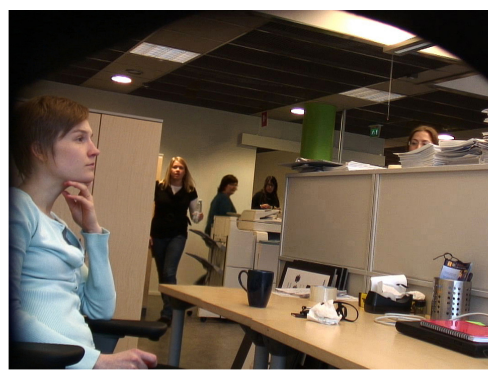
Pilvi Takala, The Trainee (film still), 2008, installation, videos, copyright the artist