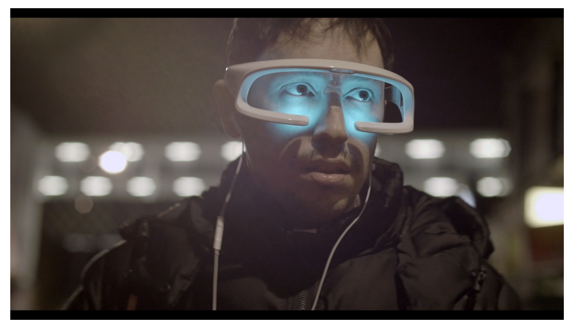
Martin Kohout, Slides (film still), 2017, Full HD video, 22'30", copyright the artist

basis e.V. Gutleutstrasse 8–12 60 329 Frankfurt